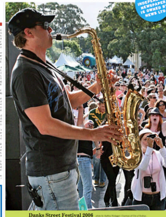
Danks Street Festival 2006

Redfern is short of loot! The article discusses the economic situation in Redfern. The article discusses the economic situation in Redfern. The article discusses the economic situation in Redfern. The article discusses the economic situation in Redfern.