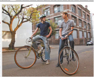
Chippendale residents champion bicycling plan for inner west

Escape from Lebanon to Victoria Street Rotts Point. The article tells the story of a man who fled Lebanon. The article tells the story of a man who fled Lebanon. The article tells the story of a man who fled Lebanon. The article tells the story of a man who fled Lebanon.